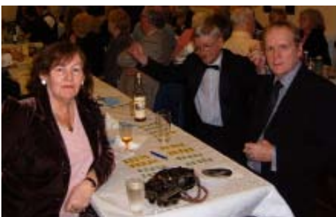
Independent Burns Night in Cumbernauld Village

4/5 Fleming Road Seafar makes headlines once again.