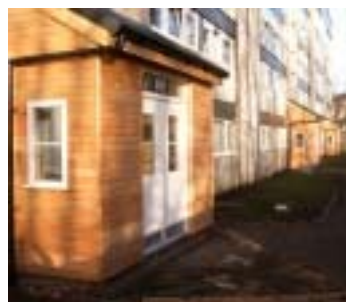
New Porches Glenacre Feb- May 2007