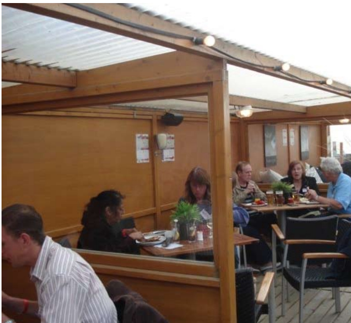
Out in the local communities in The Hague