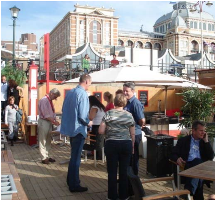
It progressed to dining al-fresco.

R4R say” We can grow stronger with the support and information shared, to make our communities safer, more robust and environmentally friendlier to live in. By building together we can make Europe a better place to live” It started with a barbecue in Scheveningen on the coast with the sun coming out in all its glory to make the day.