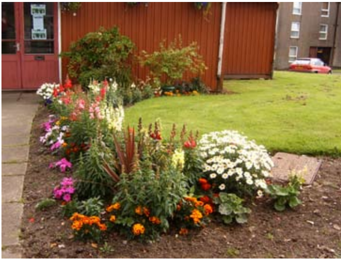
Colour me a Garden' @ Kyle Road

The garden club, 'Colour me a Garden' who work out of and hold their meetings in the Kyle Road Day Centre are taking names of people interested to join up. They meet on a regular weekly basis to discuss gardening methods and use some of their acquired knowledge in the adjacent ground; to the delight of the local residents. This is more than a gardening club as its social activities take up as much time as gardening.