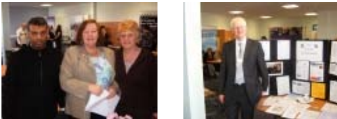
February 2007 at the CVS Conference Coatbridge.

Some pictures & promotions from the Cumbernauld Citizens, Carbrain Seniors, Kyle Trust, and other sister associations of 2007: