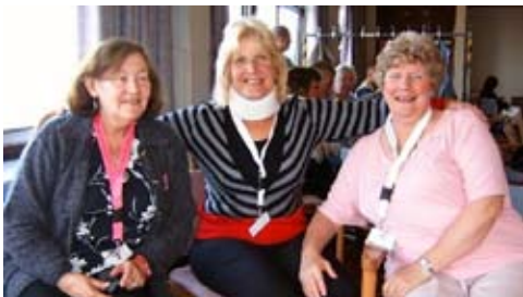
Birmingham University in Regeneration