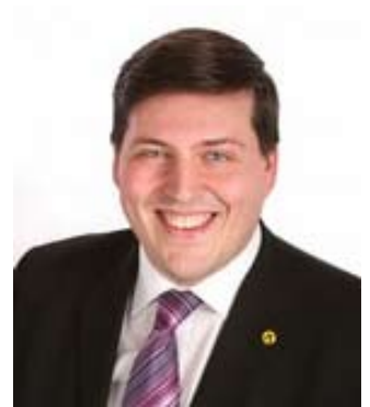
MSP's Visit to Kyle Road Day Centre